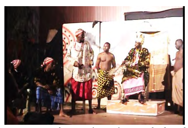
Pic.16: Council orator chants the great deeds and attributes of the king

Chants and incantations are rendered in rich poetry, proverbs and African wise sayings (idioms).. Chant may take the form of citation in honour of a great one at formal gathering, a recitation of someone's great deeds and achievements or a rendering of "salutation names" or praise names. Chanting shows the closeness of a people as each person's achievements are known too well to others. Chants can be performed in accompaniment of music, song and movement. Praise-singing is a traditional art well developed among the Zulus/Zubango , the Yoruba's Olobun-iyo or Oriki and other ethnic communities in Africa. In certain places, there are experts in chant arts as in story-telling.