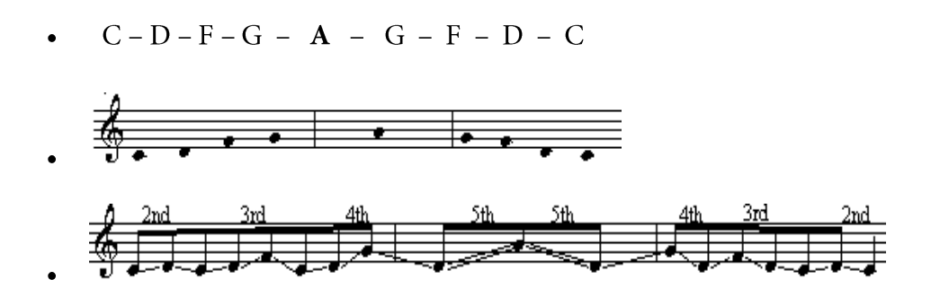
Ex. 8. Illustration of i) Linear, ii) Scalar and iii) Rhythmic pattern, Melodic Range and Curve of a Call-theme and its mirrored Response, based on Anhemitonic pentatonic scale (appendix I, bars 1-4).

A three note motif was ingeniously used and developed by Haruna Ishola in a repetitive pattern between the soloist and the chorus, to form a long melodic phrase of eight measures twice in his music (appendix I, bars 8-15 and 27-35). The three note motif (F-G-G) was also transposed through a tonal shift down a perfect fourth (C-D-D) creatively on both occasions, exhibiting his artistic dexterity. Ayinla Omowura was not left out in this creative prowess. After stating a simple four-bar theme, he continued in a