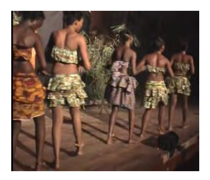
Pic.10: Maiden dance

character, Agbomma and the young maiden dance that marks the opening and closing glee of the performance.