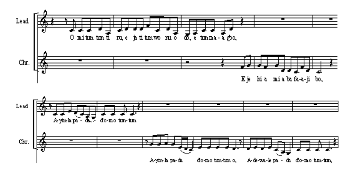
Ex.5. Melodic use based on the Hemitonic form by Ayinla Omowura (Appendix II, bars 77-80)