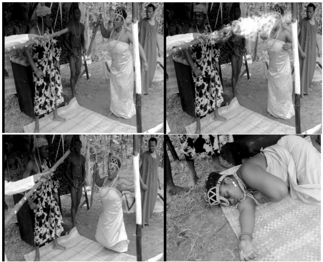
Pix.6: Cross actions of Nwanyimma in her attempt to kill King Amadi and how she met her end