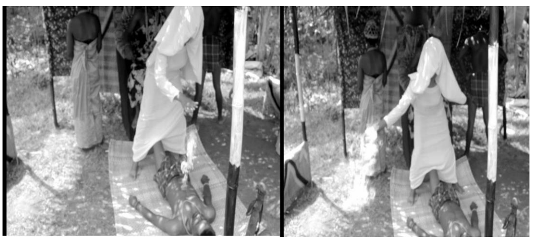
Pix.7: the Dibia dragging away columns of the poison from the body of Amanna

The effect created in Pix No. 7 below during the healing process of Amanna is another merit of this new lighting approach, which also attests to its potentials for the improvement that is being canvassed for economic rejuvenation of the Nigerian live stage.