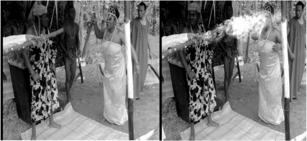
Pix.8:Nwanyimma attempting to stab King Amadi

In the pictures displayed above, Nwanyimma made frantic efforts to stab King Amadi with a sword she grabbed from the floor but was constrained by the "Shrouded Figure" who intercepted her with a mystic staff in her hand. She pointed the staff in the direction of Nwanyimma; using the staff, she disgorges conspicuous particle-likes mystic powers, which blinded Nwanyimma, penetrates into the brain and made her to slump and die.